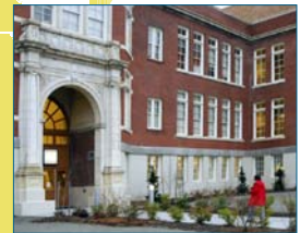
Urban League Village at Colman School, Urban League of Seattle