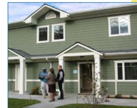
Highline Village, Highline West Seattle Mental Health