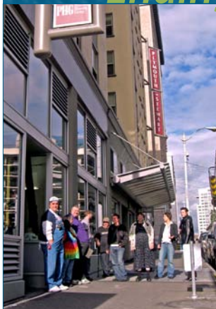
Plymouth on Stewart, 87 units for formerly homeless individuals. Plymouth Housing Group