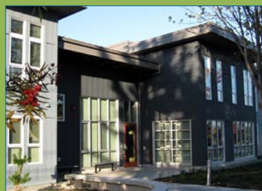
Kenyon House, 18 units for homeless adults living with HIV/AIDS. Achieved LEED Platinum certification. Housing Resources Group

With a deferred down-payment loan, people who work in Seattle—in health care or education, in banking, retail and other service jobs—can afford to live in Seattle.