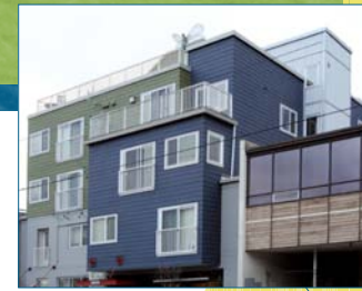
Fremont Solstice Apartments, Capitol Hill Housing