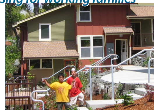
Croft Place Townhomes, 21 units of family housing. Delridge Neighborhoods Development Association

Families can afford to pay rent and still have enough for groceries and other necessities. A stable home allows children to succeed.